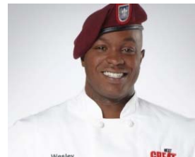
'Next Great Baker' contestant commits suicide